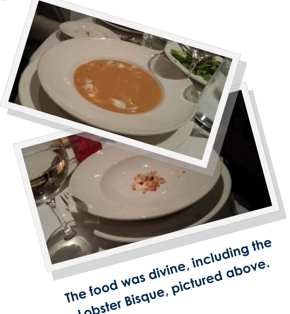
Lobster Bisque, pictured above.